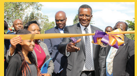
Chief Justice Maraga at the ribbon cutting.

Despite a strong vision to impact the legal sector in Kenya and Africa, enrollment to the School of Law has been much lower than predicted. Daystar will need about 100 new students in the next year to break even on expenses. Until the number of students increases and the