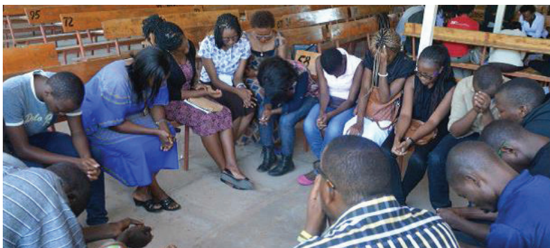
Daystar students gather for prayer.

Please join us in praise and prayer for God's working in students at Daystar!