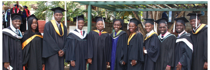
The 2018 December scholarship graduates.

For a chance to win a one-pound bag of coffee, contact Alan at 952-928-2550 or Alan@DaystarUS.org with your appreciation story.