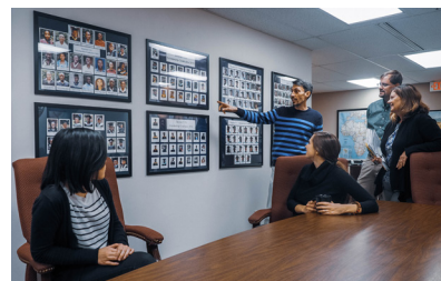
Daystar U.S. staff sharing stories of alumni

What a joy to tell your scholarship students in person of your love, support and prayers during our recent trip to Daystar in Kenya. Daystar students are maximizing your impact in Africa as they bring truth, compassion, and local solutions back to their communities and into the world.