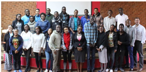
Visiting with some of this year's scholarship students

Every day, our Daystar U.S. team sees the beautiful faces of those who have been impacted by your generous scholarship support. Donors such as you have helped over 2,000 Daystar students over the past 30 years! Each photo of scholarship alumni on the walls of Daystar U.S. represents a story of change in homes and communities throughout Africa.