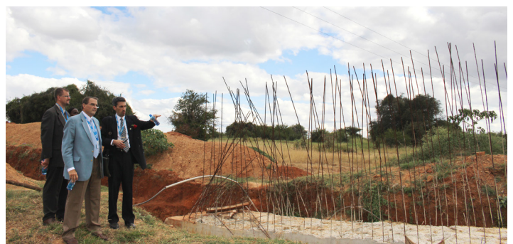
Daystar U.S. staff and board member viewing the water project

When finished, the sustainable water project will enable Daystar to educate and equip more servant leaders for every area of African society. Please join us in praying toward this end.