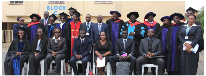
Daystar University School of Law inaugural class and professors

This accreditation comes at a timely point in Kenya's history. Crackdowns on the judiciary amidst this politically-charged climate point to the need for Christ-centered lawyers of integrity to bring reform to Kenya's justice system. Kenya's Director of Public Prosecutions recently stated that, "The justice system only works if lawyers, prosecutors, magistrates and judges are fair and just." (Daily Nation, 2018)