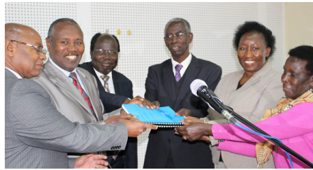
Daystar's expert task force celebrates clean audit